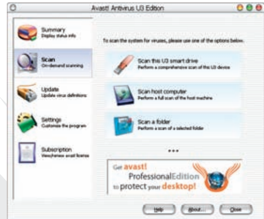
screenshot of avast! antivirus U3 program (Scan)